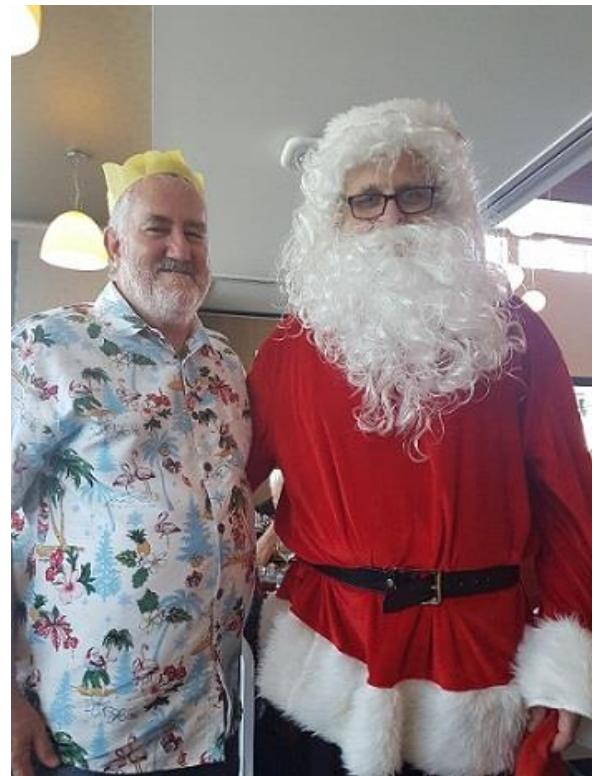
Santa and friend