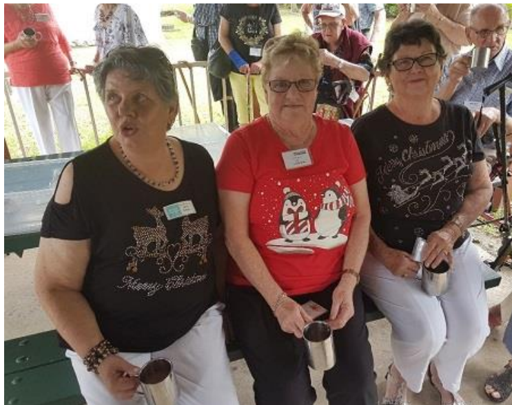
in the spirit of things.